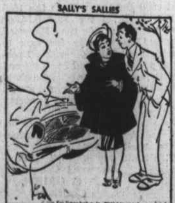
"After all, dear, what's the sense of paying insurance and not collecting on it?"