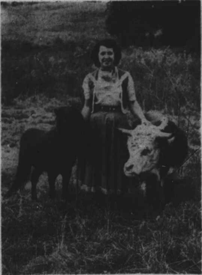
ON DISPLAY Friday and Saturday on Main Street across from the library will be the smallest horse in the world and smallest bull, pictured here. The visit of the diminutive animals will be sponsored by Haywood Post 47 of the American Legion...