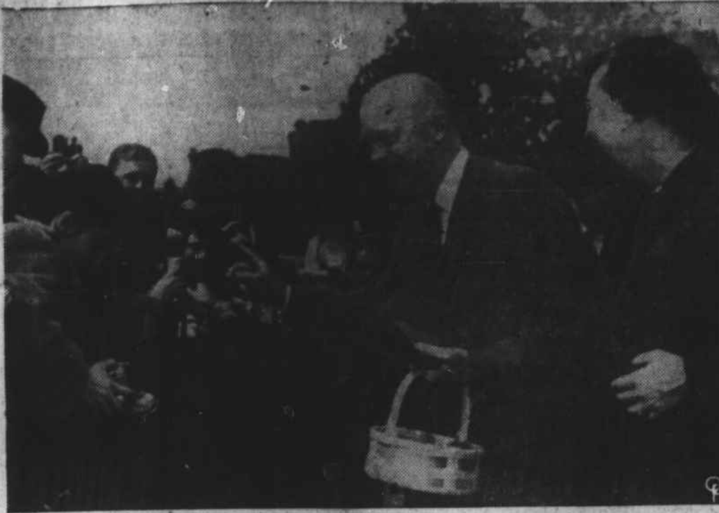
FENCED OFF FROM the famous White House putting green, a crowd of children and their parents wait anxiously as President and Mrs. Eisenhower pass out eggs from a basket during the traditional Easter Monday egg roll. Only adults accompanied by children under 12 were admitted to the egg rolling area. "I'll see you all next year," said Ike prophetically to his young visitors.

some practical experience. Motherhood shouldn't interfere with their trying to gather knowledge for the future.