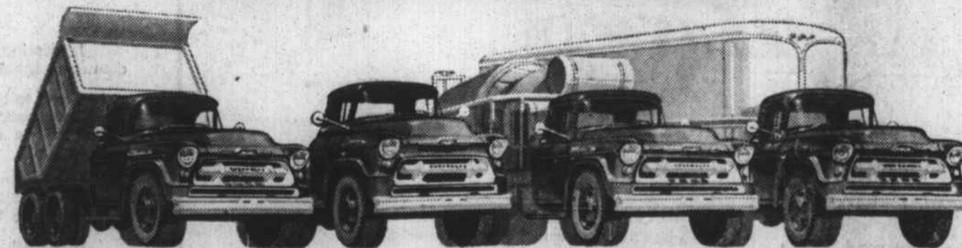
10000 Series truck with tandem. • 9000 Series L.C.F. • 10000 Series truck with mixer. • New 8000 Series model as tractor.