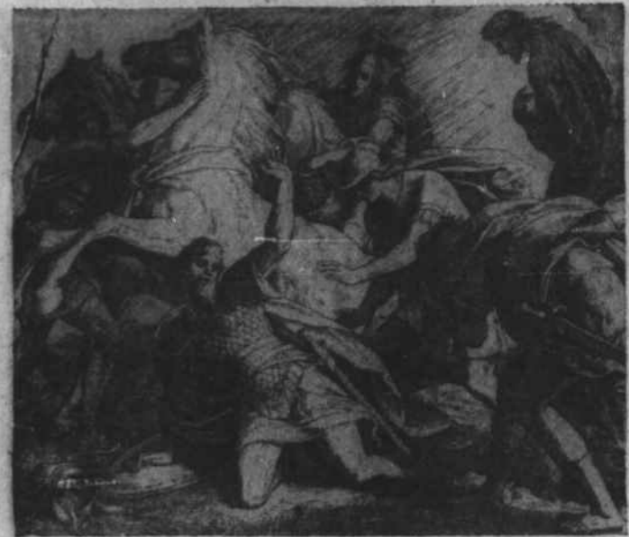
Conversion of Saul.

"I am not ashamed of the Gospel of Christ; for it is the power of God unto salvation to every one that believeth."—Romans 1:16.