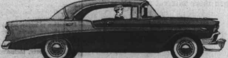
Bel Air Sport Sedan—here's your buy for the most luxury and distinction in Chevrolet's field!

And look at the model choice you've got. Twenty in all, including four hardtops—two of them "Two-Tens." Six station wagons—three "Two-Tens" and one "One-Fifty." So even among the lower priced Chevrolets you have plenty of choice. Come in and look them over!