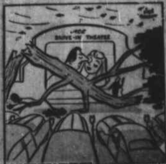
"Is there a tree surgeon in the house?"