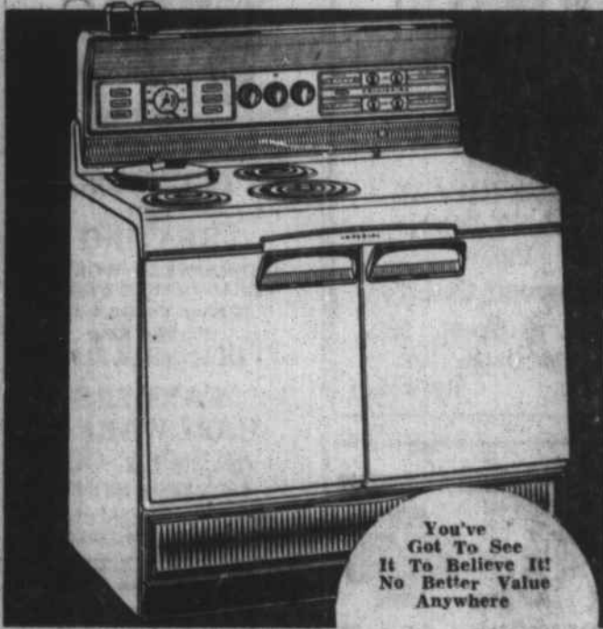
You've Got To See It To Believe It! No Better Value Anywhere

FOR 3 DAYS AND NIGHTS WE'LL TRIPLE YOUR TRADE-IN ALLOWANCE!