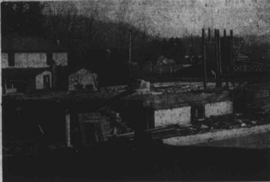
JUST A FEW WEEKS AGO, the Milas Davis place had reached this stage. No longer in use as a residence, it was being torn down to make way for a modern office building.