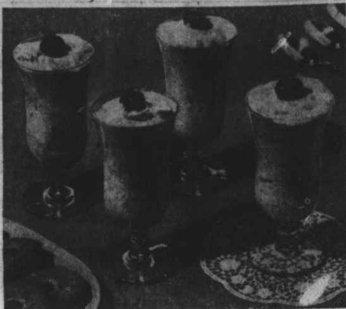
PRUNE CHIFFON — Light and fluffy meal finisher.

Method: Sprinkle gelatin over cold water in top of double boiler. Place over boiling water and stir until gelatin dissolves. Add sugar and salt; stir until sugar dissolves;