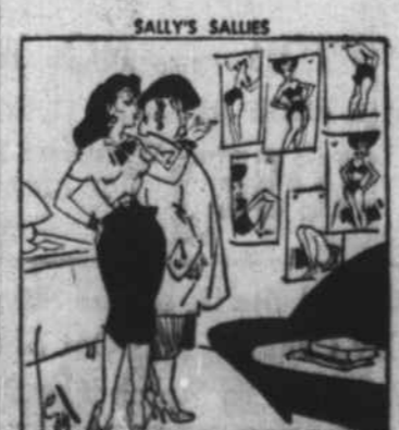
"Brother takes that new Visual Aid course in school and this is some of his home work."