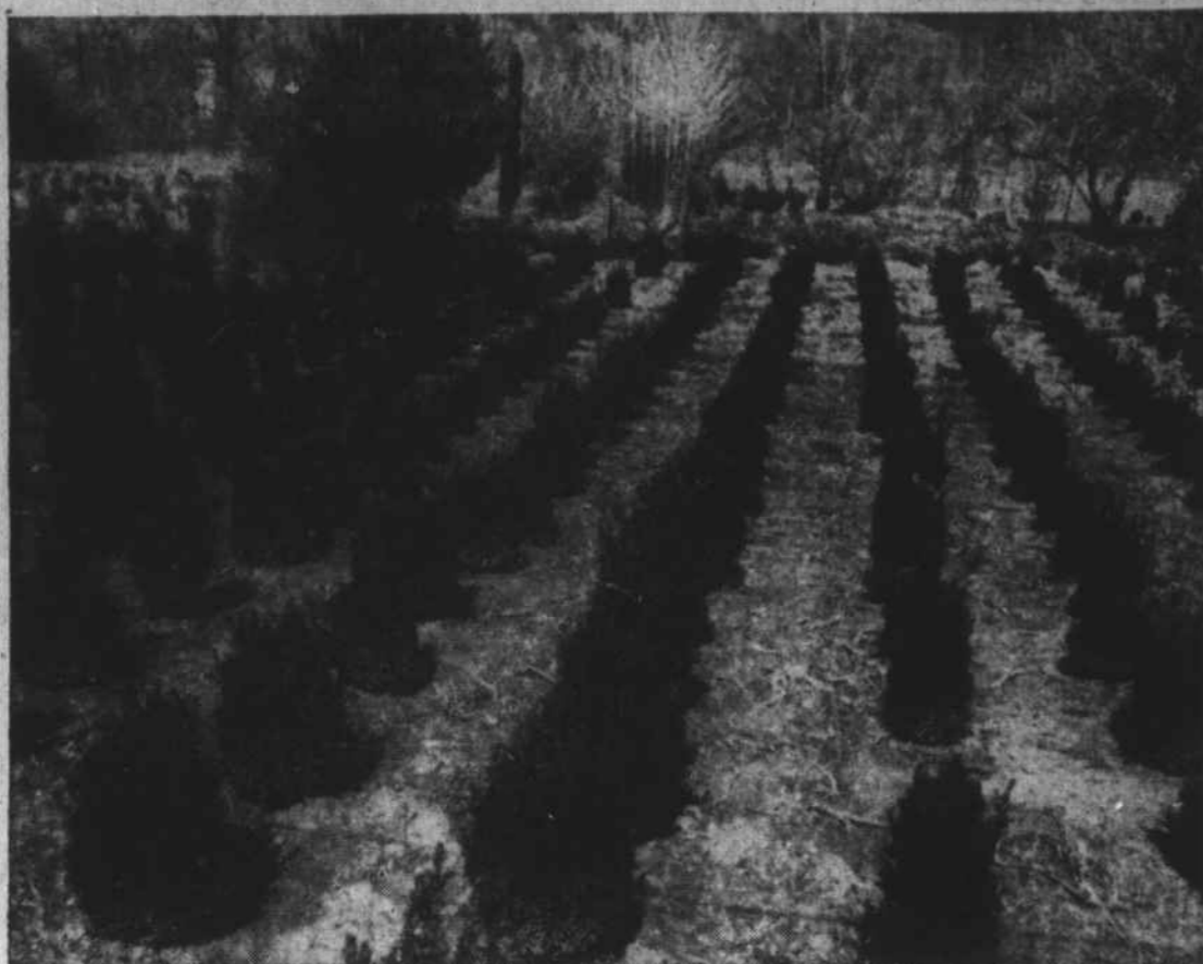
COMMERCIAL SHRUBBERY PRODUCTION has been suggested as an excellent means of additional income for Haywood County farmers. The plot pictured is at Clyde, in Swain County, boxwood tree producer are said to be realizing a higher income per acre from their trees than from tobacco.

ANSWER: Yes. The Agricultural Stabilization and Conservation committee sought and received permission to allow North Carolina farmers to harvest, for hay or silage, this growth.