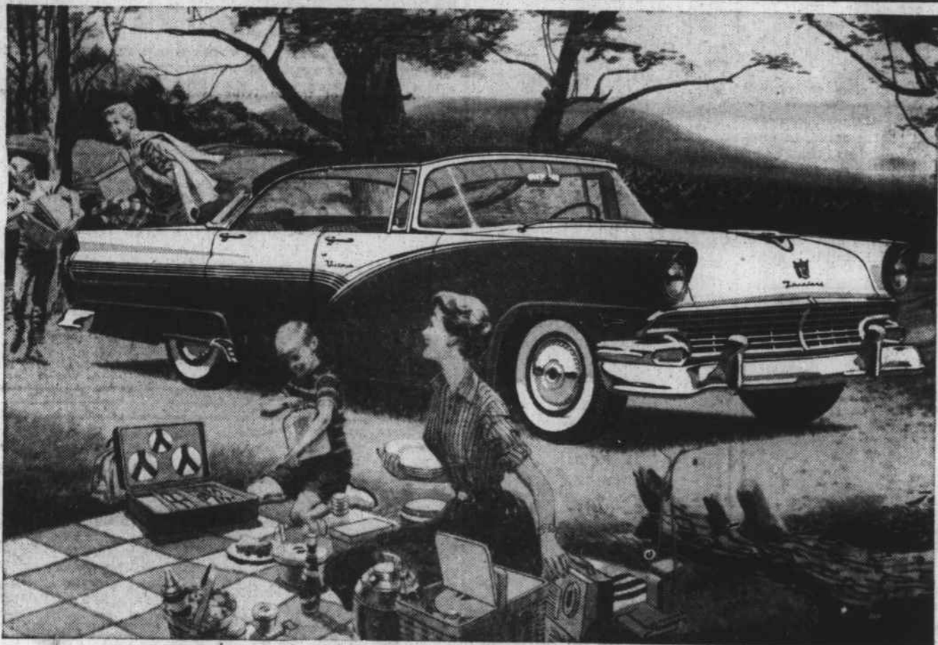
The family "chauffeurs" are going for Ford in a big way for some mighty big reasons

Westmoreland feels that older control measures should not be completely abandoned in favor of dalapon.