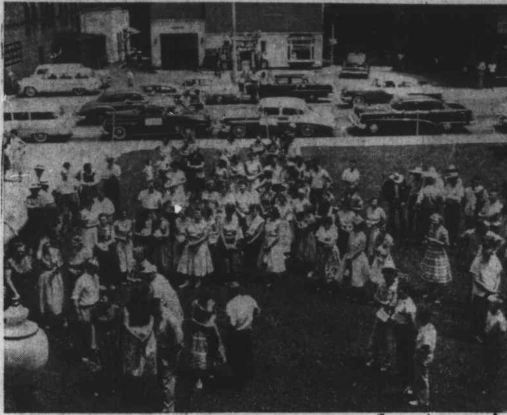
COLORADOANS AND CAROLINIANS renewed acquaintances here Monday on the courthouse lawn as the Westerners arrived in the county via Soco Gap. The visitors were greeted by town and county representatives and then given refreshments. The group took a tour of Haywood County Tuesday, and visited the Champion Paper and Fibre Co. plant in Canton yesterday.