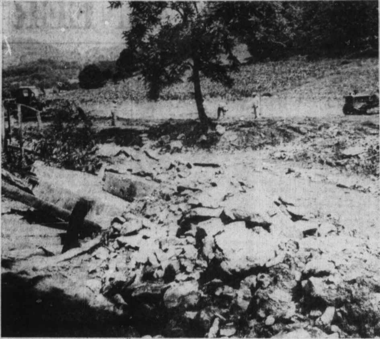
THIS 'MONUMENT' of rocks was left behind by the flash flood at Cove Creek, which carried along heavy boulders as easily as if they had been pebbles. The blocks of concrete shown here may have come from one of the bridges which was washed out by the flood. In the background are employees of the State Highway Department, who were working on the road at this point.

The U.S. Census Bureau expects there will be 25 million more Americans in 1960 than there were in 1950.