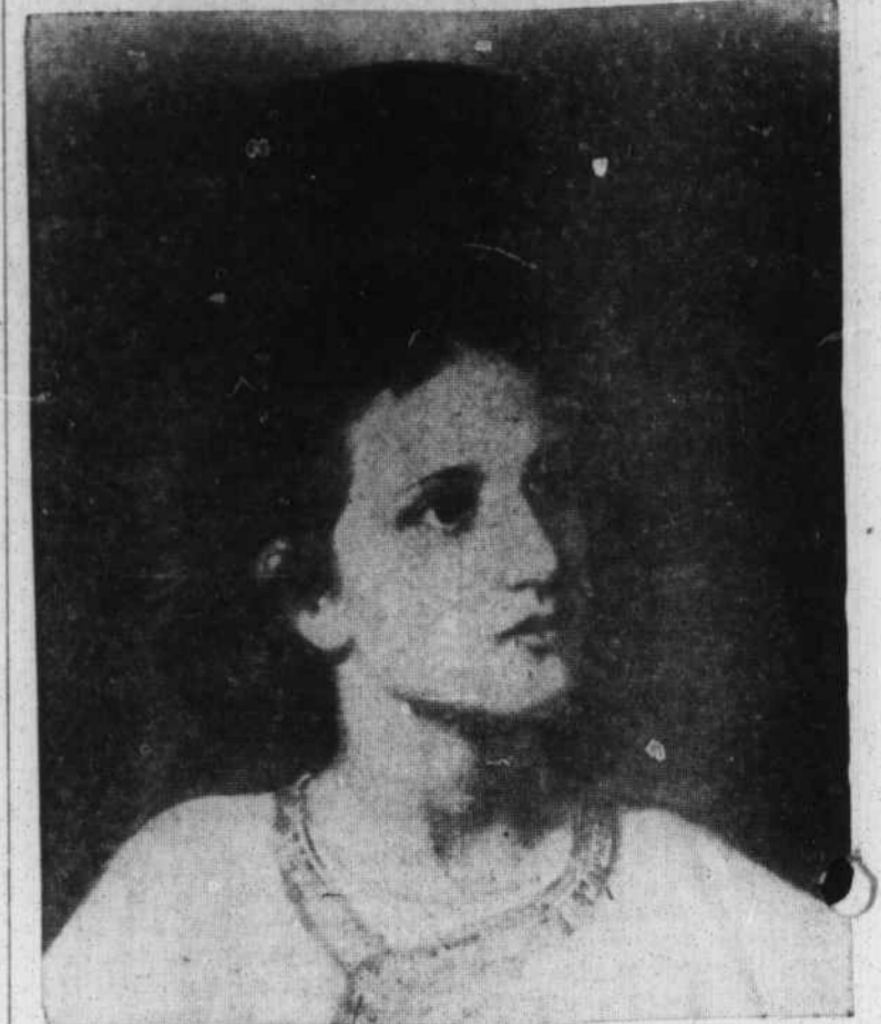
Head of Christ. "Being made perfect, He became the author of eternal salvation unto all them that obey Him."—Hebrews 5:9.