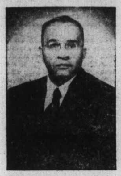
BISHOP CLAUDE ALLEN