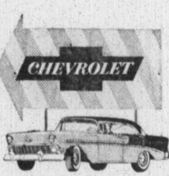
America's largest selling car—2 million more owners than any other make.

To the eye, the new Corvette and the new Chevrolet are far different. But these two champions have one superb quality in common—both were born to cling to the road as though they were part of it! Chevrolet's astonishing roadability is a big reason why it's America's short track stock car racing champion. It can and does out-run and out-handle cars with 100 more horsepower. When you wed rock-solid stability to superb engines such as the 225-h.p. V8 that flashed the Corvette to a new American sports car record—then you get a real championship combination. Stop by for a sample!