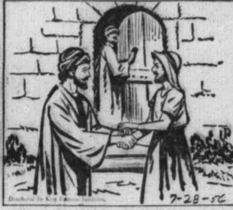
Ending his epistle, Paul writes: "Greet ye one another with a kiss of charity. Peace be with you all that are in Christ Jesus. Amen." MEMORY VERSE—Hebrews 13:6.