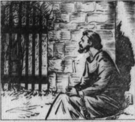
Herod planned to keep Peter in prison until after the days of unleavened bread, then turn him over to the Jews who hated him. His friends prayed continuously for him.