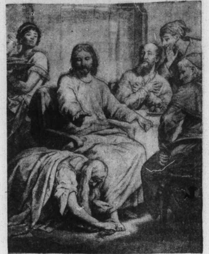
Anointing the feet of Jesus. "The Lord is my helper, and I will not fear."—Hebrews 13:6.