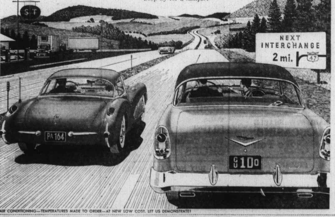
AIR CONDITIONING—TEMPERATURES MADE TO ORDER—AT NEW LOW COST. LET US DEMONSTRATE!

Only franchised Chevrolet dealers display this famous trademark