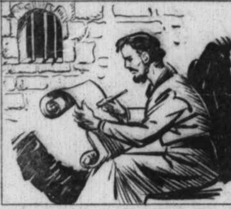
Peter wrote to the Christians in various scattered churches to be courageous under persecution, and to rejoice, "inasmuch as ye are partners of Christ's sufferings," and would share His glory.