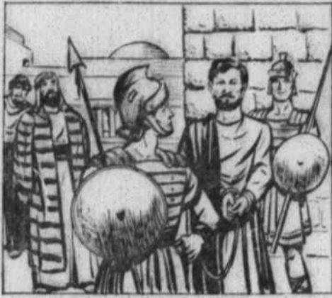
After the crucifixion of Jesus, Herod began to persecute Christians. He killed John's brother, then when he found it pleased the Jews, he seized Peter and threw him in prison.

Scripture—Acts 12:1-5; Peter 1: 4:12-5:14.