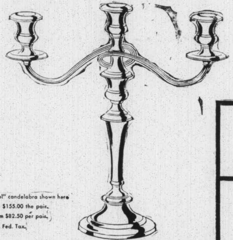
The "Bristol" candelabra shown here (14 1/2" ht.) $155.00 the pair. Others from $82.50 per pair. Prices incl. Fed. Tax.

NEW DESIGN FOR GIVING: GORHAM STERLING CANDELABRA... YOU CAN "CHANGEABOUT" EACH ONE OF THE PAIR EIGHT DIFFERENT WAYS!