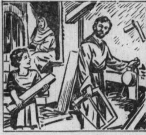
Jesus went home to Nazareth from Jerusalem with His parents, and obeyed them. He "increased in wisdom and stature, and in favor with God and man."