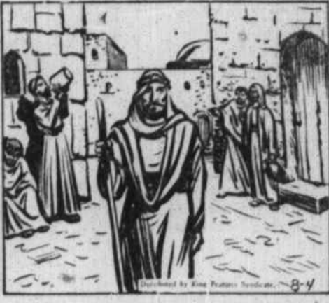
The man who has turned from wicked ways may have evil spoken of him by his former companions. Be sober, watch and pray, Peter counsels.