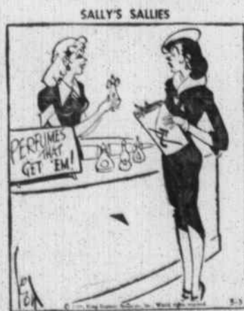
"Certainly I'm married. When I got mine I was a customer just like you."

You are invited to worship in Hazelwood's friendly Presbyterian Church. Come and enjoy our warm fellowship and good music.