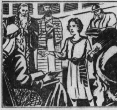
St. Luke says of the Boy Jesus: "And the child grew and waxed strong in spirit, filled with wisdom; and the grace of God was upon Him."

Scripture—Luke 2:40-51, 52; I Peter 2:1-3; 4:1-11; II Peter 1.