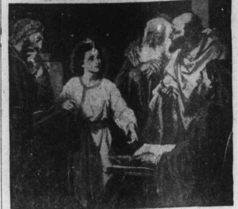
Christ in the temple.

"Ye are My friends, if ye do whatsoever I command you."—John 15:14