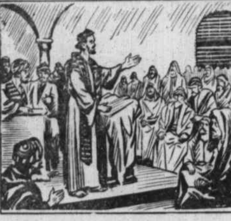
Peter tells the disciples "to add to their knowledge patience and godliness; to godliness brotherly kindness and love." MEMORY VERSE—John 15:14.