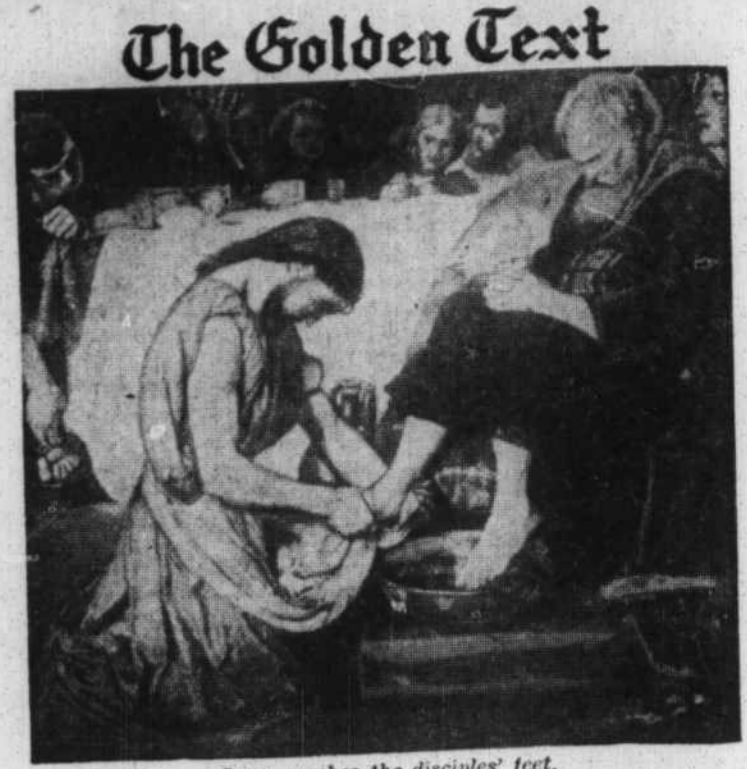
Jesus washes the disciples' feet. "A new commandment I give unto you, that ye love one another."—John 13:34.

Warning was given to avoid the materialistic way of life so prevalent in the world today. Emphasis was placed on seeking the things of God (fruits of the spirit such as love, joy, goodness, peace, mildness, long suffering, kindness, self-control, against which there is no law).