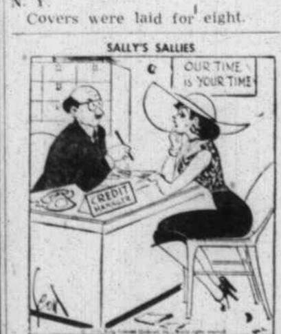
"Yes sir, I had accounts with other stores but they cut me off. That's why I'm here."