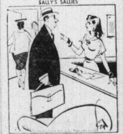
"You'd like to see the office manager? Well, she's just going into her husband's office."

minute, rush. Fruit salads with a cream cheese or gelatin base. Potatoes — French-fried and frozen for spur-of-the-moment occasions. Mushrooms—sautéed and frozen for use in casseroles.