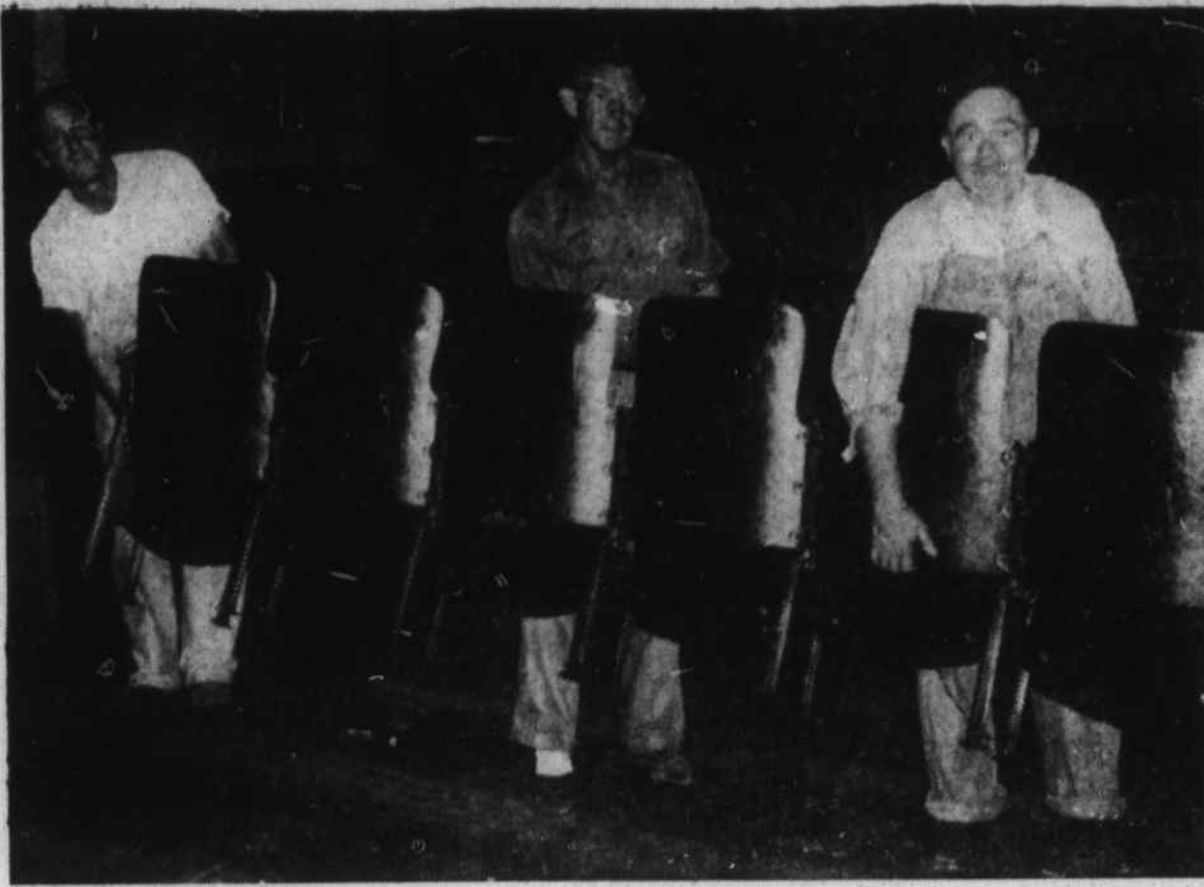
BY NOON WEDNESDAY all the seats in the left section of the Waynesville Township High School auditorium and half of those on the right had been removed by workmen to make way for the conversion of the structure into classrooms. The project will convert the auditorium and old library into a new library, audio-visual room, study hall, and five classrooms.

(Continued from page 1) launched some months ago by the joint efforts of the Haywood Community Development Program and the Haywood Medical Society, has received a number of letters from various sources, congratulating the leaders and the entire county on sponsoring such a program.