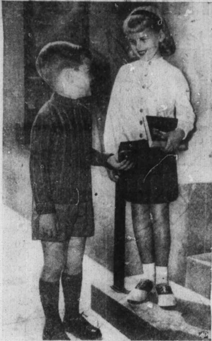
Head of the class . . . Educated sweaters go back to school this fall, in new miracle yarns which can be washed in a jiffy, dried without blocking and retain their shape and color. Pictured are a boy's turtle-neck pullover in cable stitch and a girl's pebble-stitch cardigan with brass buttons, both in the new bulk style, both in tyora, newest in the synthetic yarn lineup, requiring minimum care.