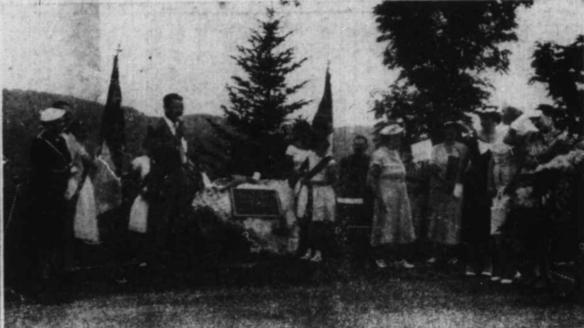
A MEMORIAL MARKER honoring 125,000 North Carolina Confederate Veterans was unveiled at Beech Gap Saturday afternoon by the N. C. Division of the United Daughters of the Confederacy.

Final plans are being completed for the annual Canton Flower, Vegetable, and Fruit Show, sponsored by the Canton Council of Garden Clubs.