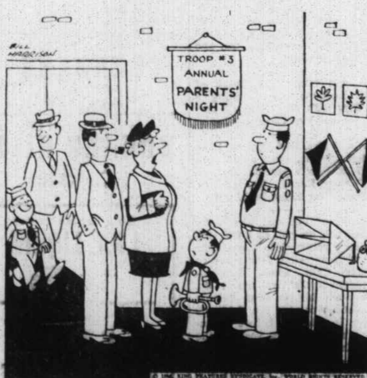
"We don't want Quincy to be selfish. After all, he's been troop bugler for a whole week."