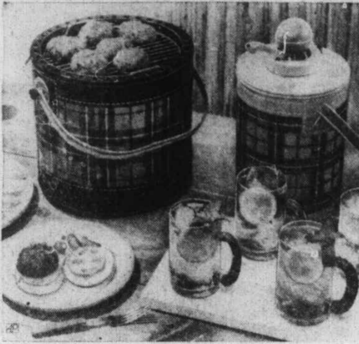
HAMBURGERS AND FIXINGS — Served with iced tea.