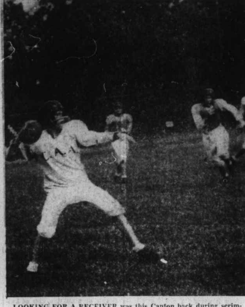
LOOKING FOR A RECEIVER was this Canton back during serimmage at the CHS stadium Tuesday afternoon as the Black Bears prepped for their opener against the Bethel Blue Demons at Can-