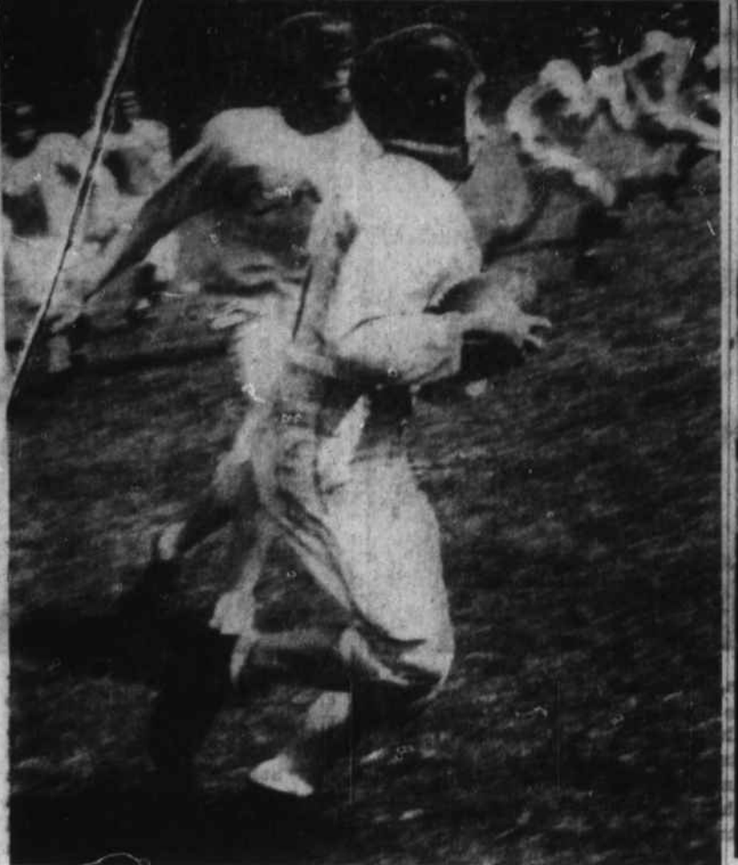
CANTON'S BLACK BEARS-With three veteran backs returning and a large group of promising understudies on hand-may field the outstanding offensive team in the Blue Ridge Conference this season. The squad's success may depend on the defensive ability