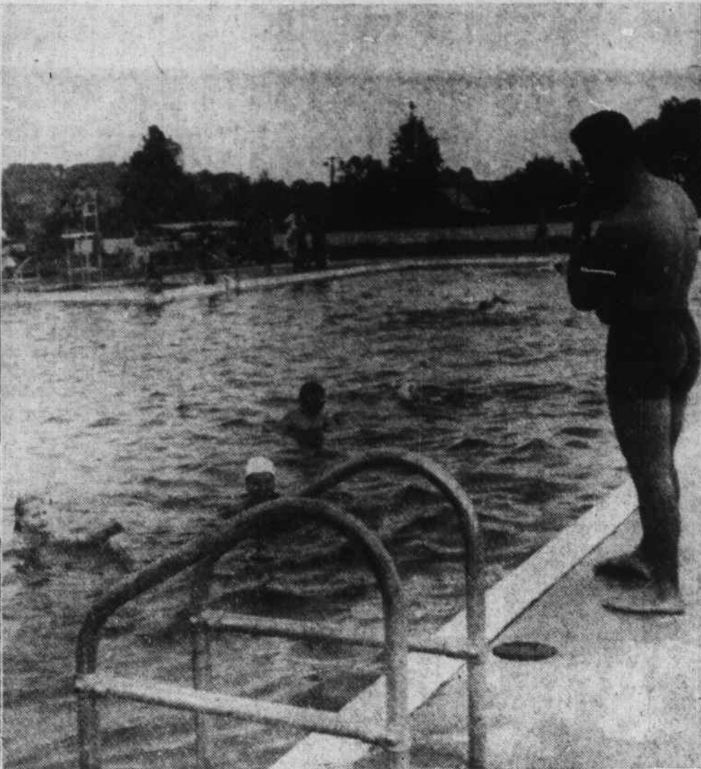
'AS SAFE AS POSSIBLE' is the aim of Recreation Center officials toward insuring the safety of swimmers in this area's newest pool. Four full-time lifeguards and three part-time guards have been hired to serve during the remainder of the time the pool is open.