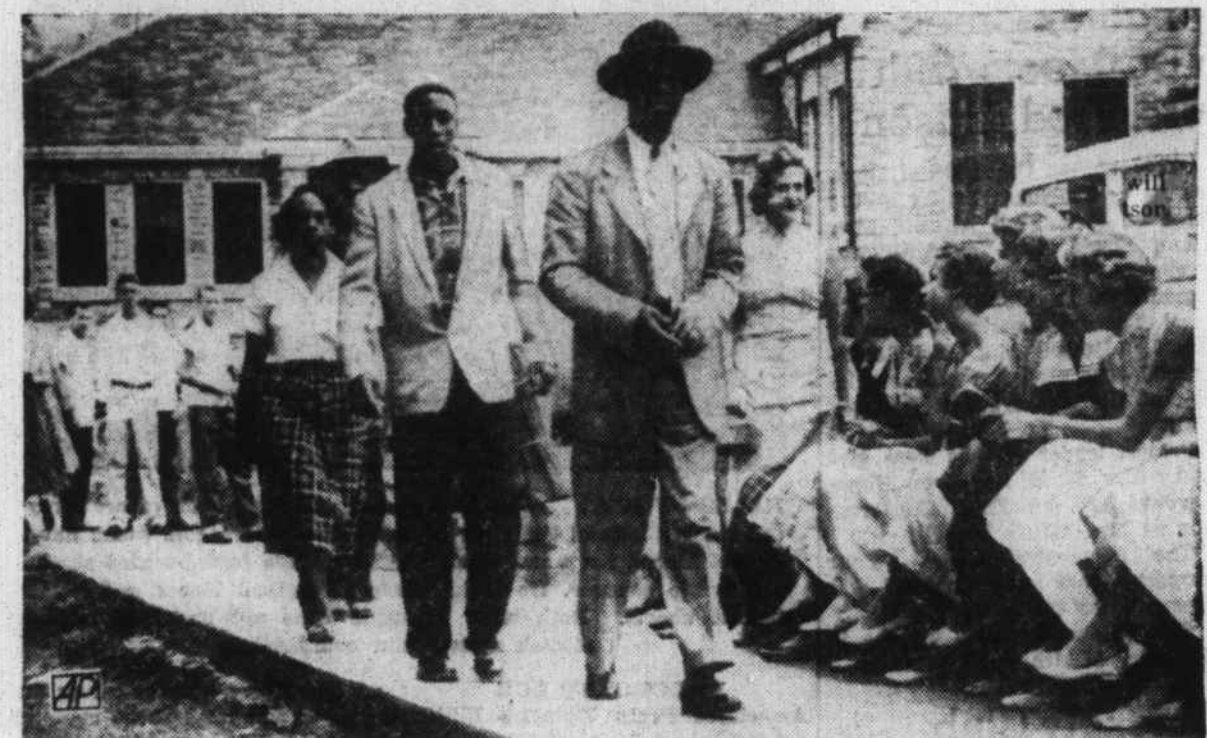
FIVE NEGRO STUDENTS, accompanied by their parents, who asked to be enrolled in Swain County High School at Bryson City, are watched quietly by white students as they leave the school

after being told by school officials they already had been assigned to Jackson County school.