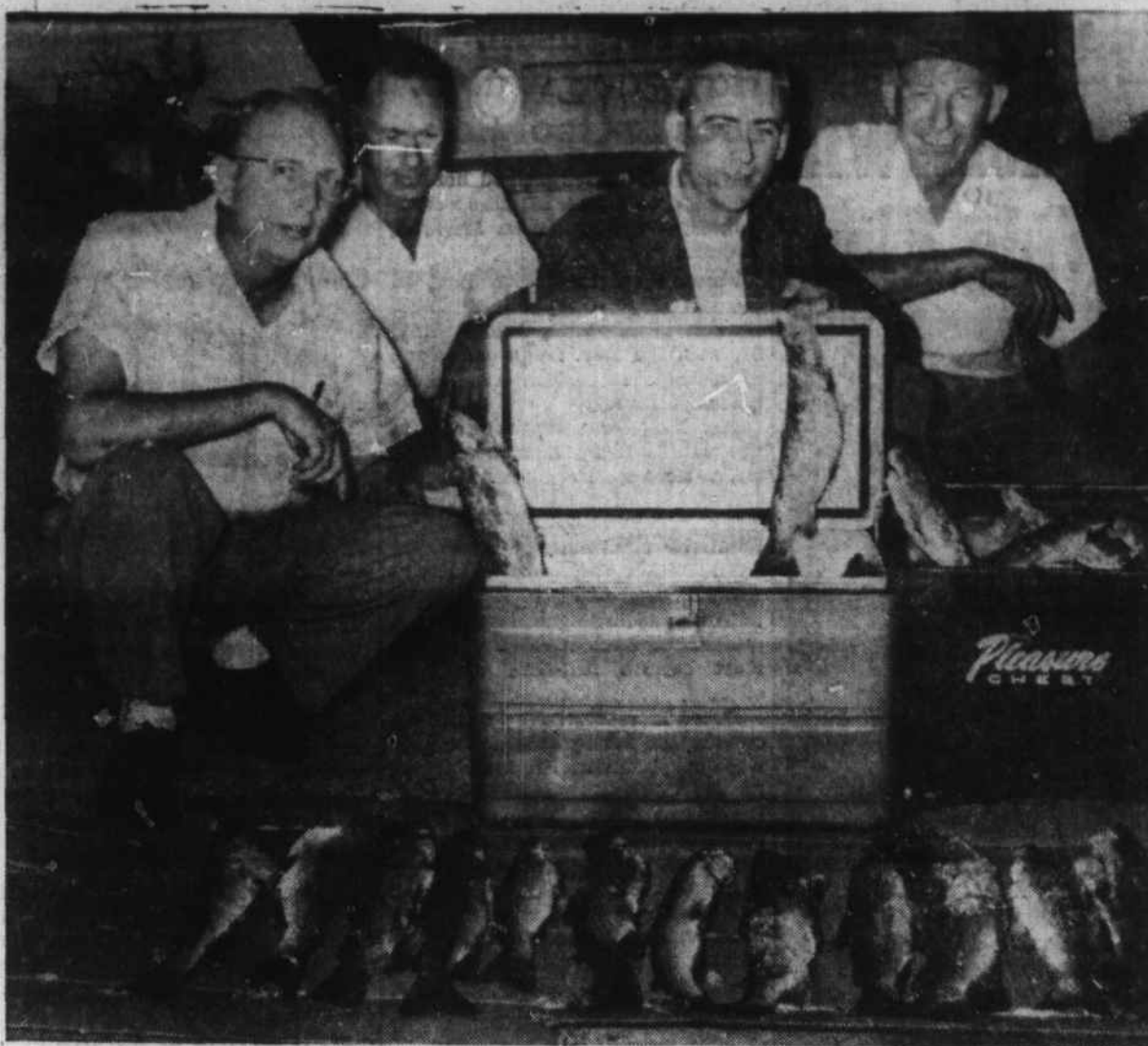
BACK FROM MONTANA with a haul of 70 trout rainbow, brown, and speckled trout from streams some 50 miles south of Butte, Mont. The quartet of mountaineers made their haul of (Mountaineer Photo).

Largest world producers of tin and tin-plate are Malaya, Indonesia, Bolivia, Belgian Congo, Thailand, Nigeria and Texas.