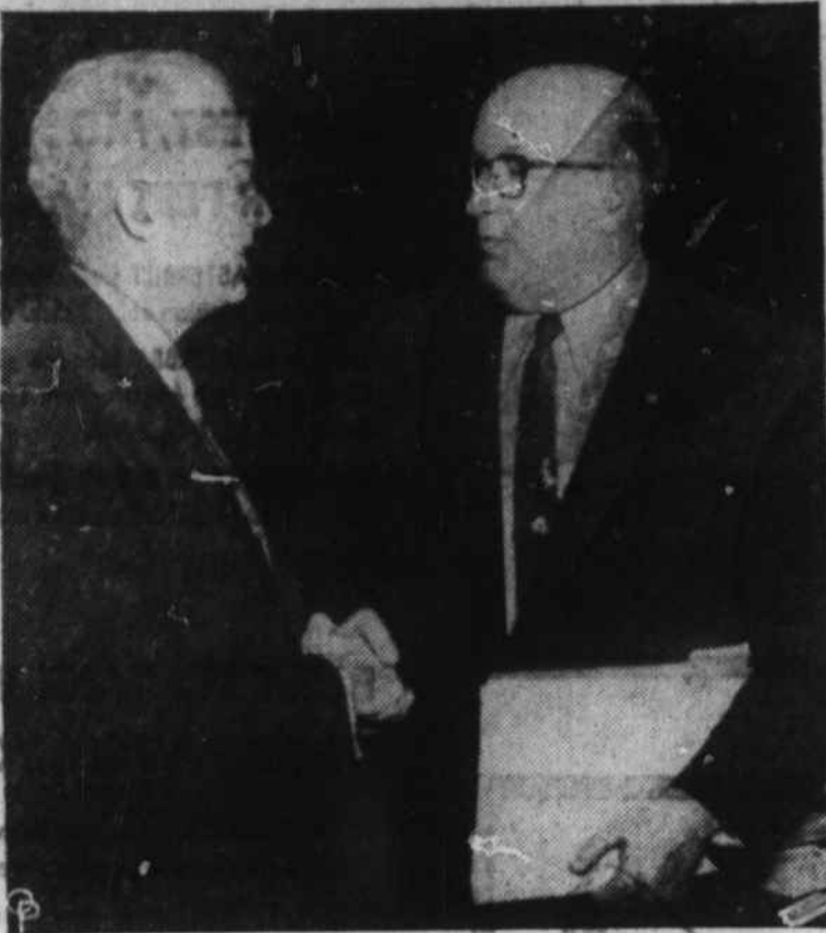
DEMOCRATIC NATIONAL CHAIRMAN Paul Butler (left) and GOP national chairman Leonard Hall shake hands as they meet at a hearing of the Senate Elections subcommittee in Washington.