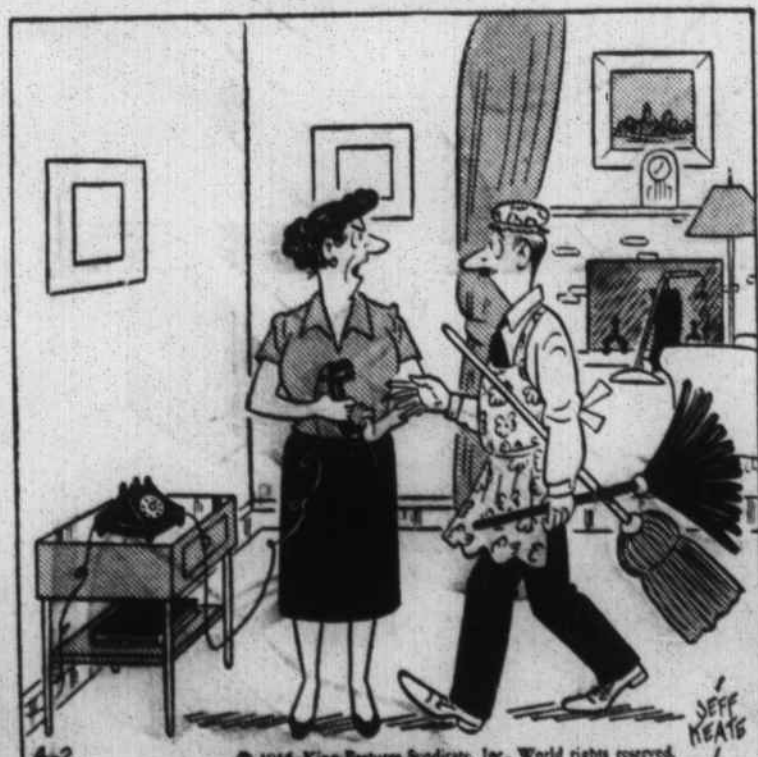
"It's your boss . . . now show him you're not the type who can be imposed on!"