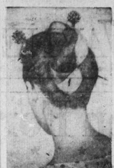
TWO-TONE CHIGNON . . . Tint your hair to match your ensemble. That's the newest wrinkle in the beauty world. This chignon was designed by Dorfs Fleischer.

Such combinations 58 pastel blue and black are chic for summer. Ditto yellow and white. Two shades of green suggest the cool look of