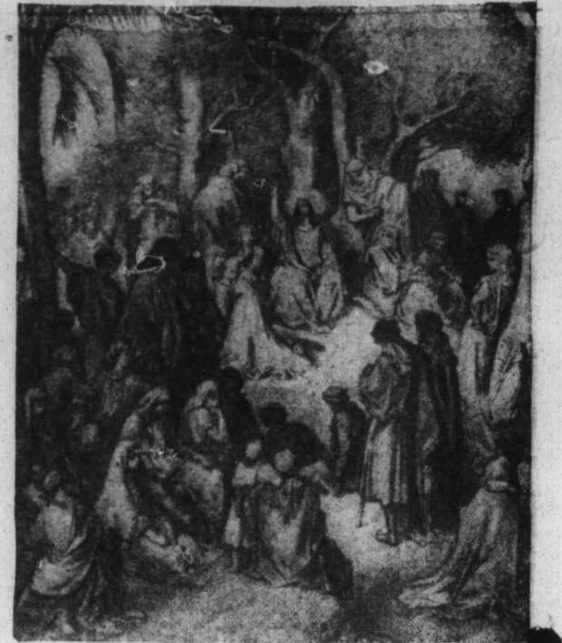
The sermon on the mount. "Our Father which art in heaven, Hallowed be Thy name. Thy kingdom come."—Matthew 6:9-10.