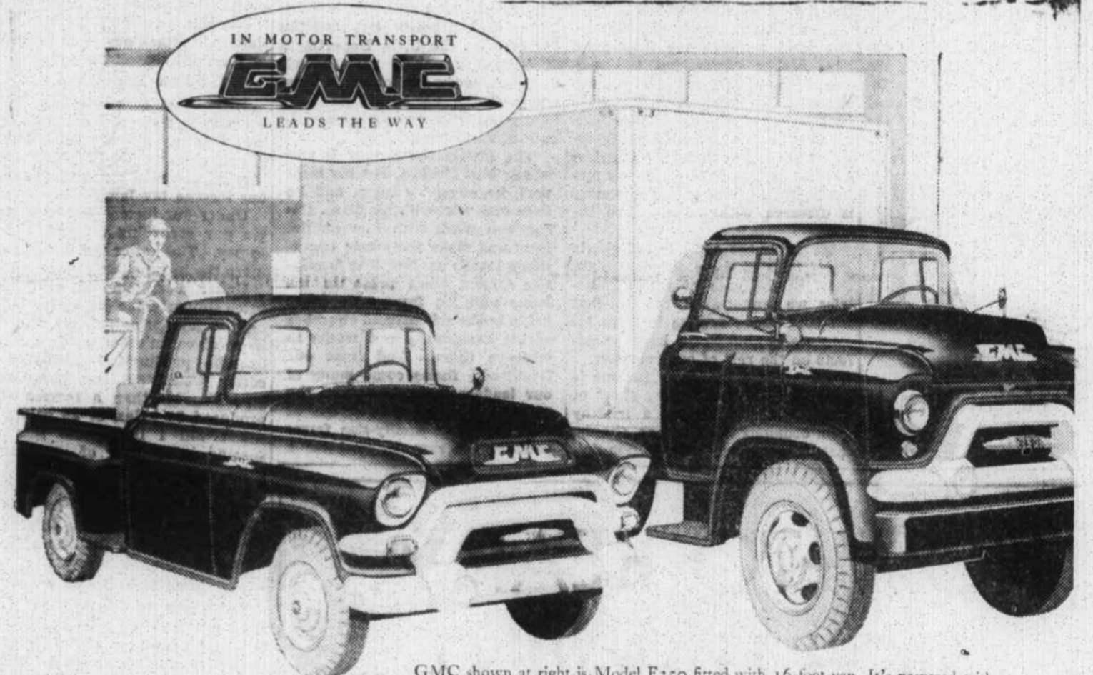
GMC shown at right is Model F350 fitted with 16-foot van. It's powered with a 140 h. p. six-cylinder engine — has over-size axles rated at 4,500 lbs. front; 14,000 lbs. rear. It's designed for 18,000 GVW truck-work. The smaller truck at left is GMC's popular 1/2-ton pickup with a 130 h. p. six-cylinder power plant.