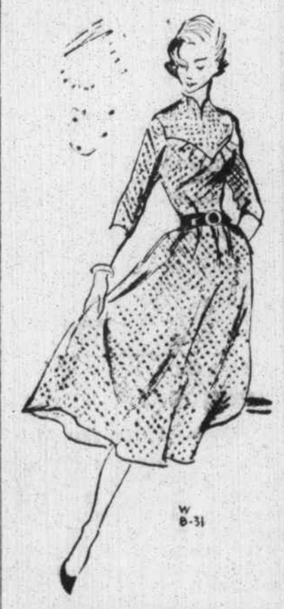
By VERA WINSTON

TISSUE-WEIGHT nubby tweed in a yellow and brown mixture with red and green nubs has been neatly worked into a very nice, easy little dress, good for col-lege, for business wear, for casual all-day wear. The yoke with a high notched neckline uses the check on the straight; the rest of the fabric is cut and handled on the diagonal. Shaped tucks lend softness to the bodice, a detail repeated below the waist. The pockets are slashed into side ams. The dress has a contour belt of bronze leather and is zipped in back.