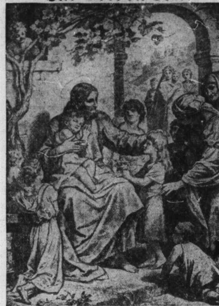
Christ blessing little children.

"The Spirit, and the bride say Come. And let him that heareth say Come! And let him that is athirst come. And whosoever will, let him take the water of life freely."—Revelation 22:17.