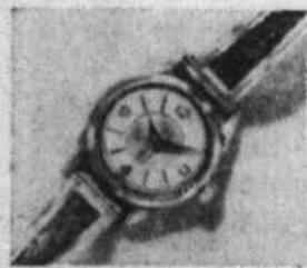
Aviatix—dainty size, natural gold color with leather-set expansion band. $67.50

It's the advanced modern design for today's modern-minded woman—superb jet styling for sport watches geared to your busy life. Performance-tested by jet pilots under rigorous flight conditions.