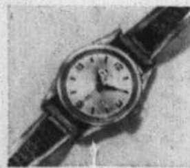
Comet—dainty size, all steel, leather-set expansion band. $57.50