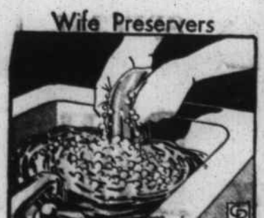
Nylon and underthings should be washed with the garment turned inside out. This method prevents snagging and protects the luster of the material. Wash such garments in warm soap or detergent suds, as usual.