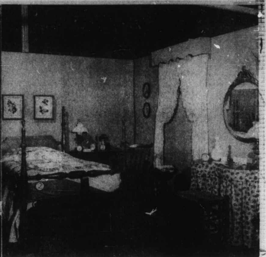
WAYNESVILLE HOMEMAKERS, featured comfortable sleeping area, with ideal furniture, adequate closet space, attractive accessories. A blue ribbon award.