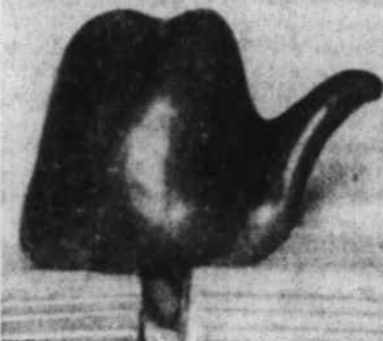
MAY WE pour you some pepper tea? This does not happen to be a new plastic tea pot, but one that grew in the garden of Mrs. Frank Medford, Crabtree—a pod like a tea pot.

About 13 per cent of U. S. spending units (families and single people) had incomes over $7,500 in 1955 compared to 6 per cent in 1950.