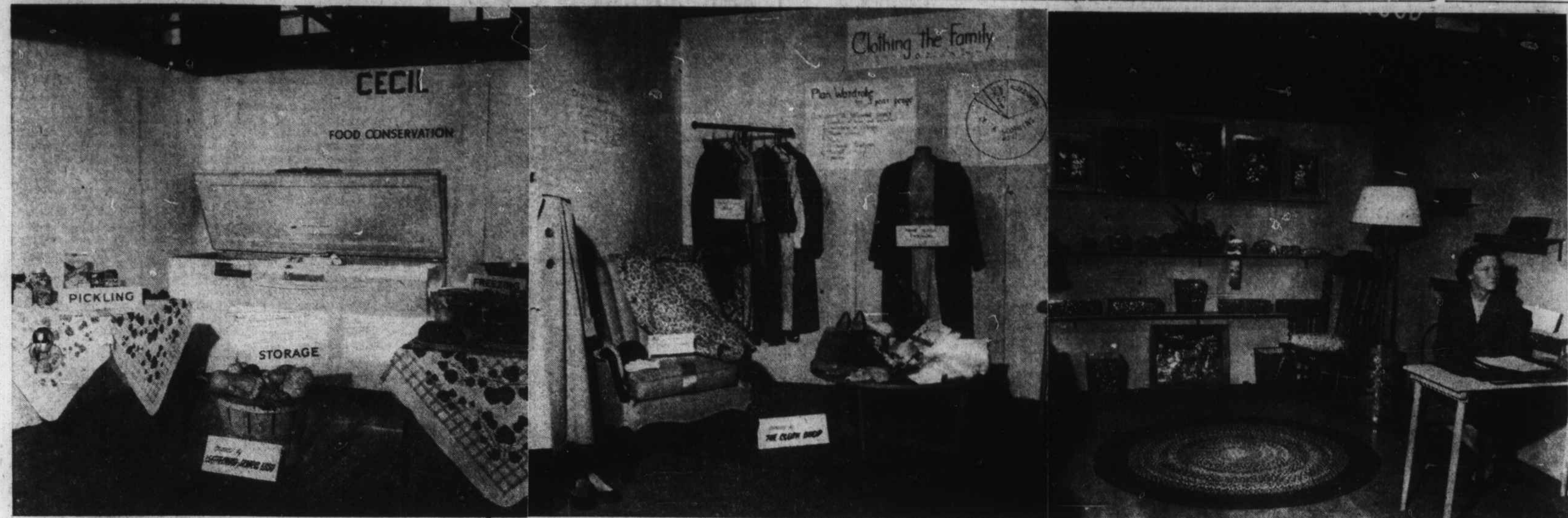
CECIL'S booth showed various phases of food conservation, with a number of items used in each division of the program. A blue ribbon winner,