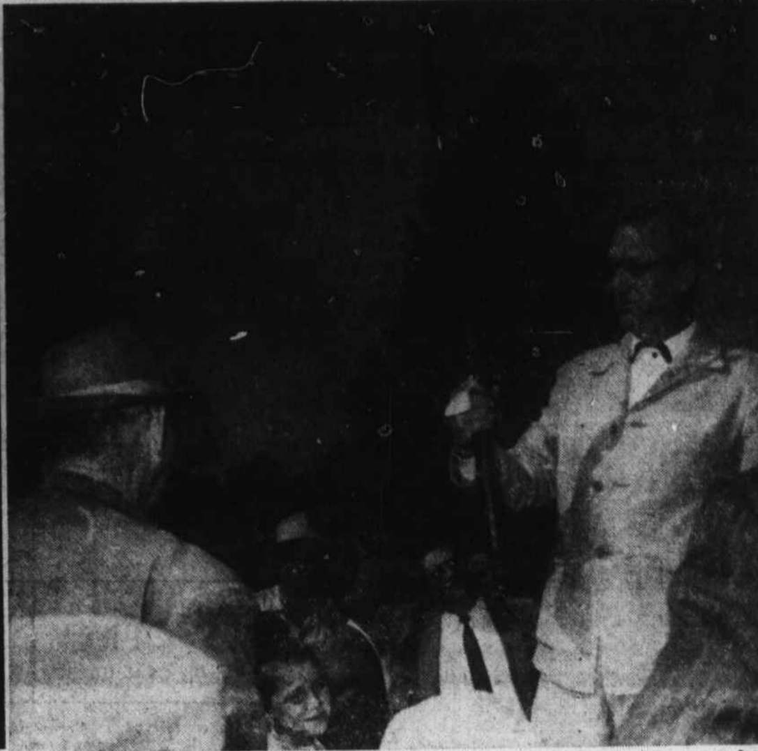
"JUST IN TIME for the hunting season," observed auctioneer Cronkite as he put this shotgun up for sale, and later sold it to the high bidder for $8.50. A total of $475.50 was sold at the first auction, and more is expected to change hands at the second auction this Saturday morning.