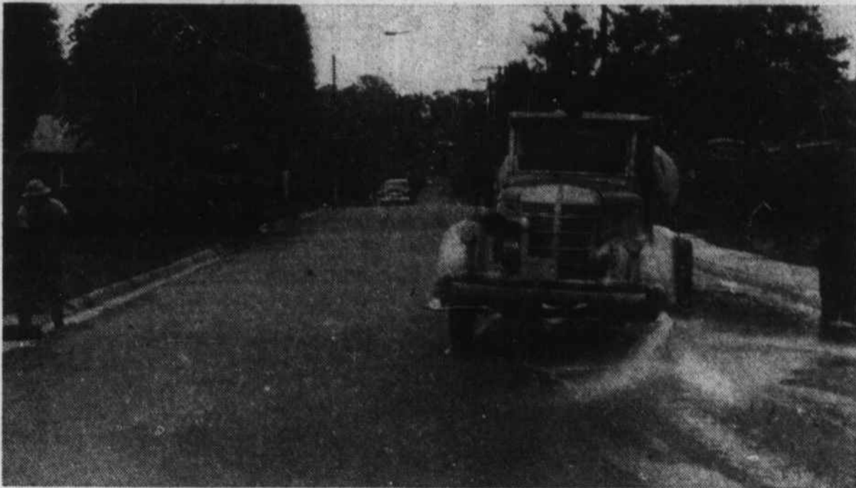
KEEPING HAZELWOOD Clean is one of the major projects of the Finer Carolina committee working with town officials. Weeds are cut from vacant lots; streets are washed, and garbage collected on a systematic schedule throughout the town.

The 11 pages in this edition is being presented by the Hazelwood 'Finer Carolina' Committee in the interest of a better community project. Feeling that the full presentation of facts about the community would be something every citizen would need, appreciate, and derive a distinct benefit, is the reason for this special section of The Mountaineer today. The Committee