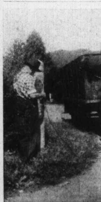
STREET MARKERS SPROUT at every Hazelwood corner. Here a town workman puts the final touches to a newly erected marker.