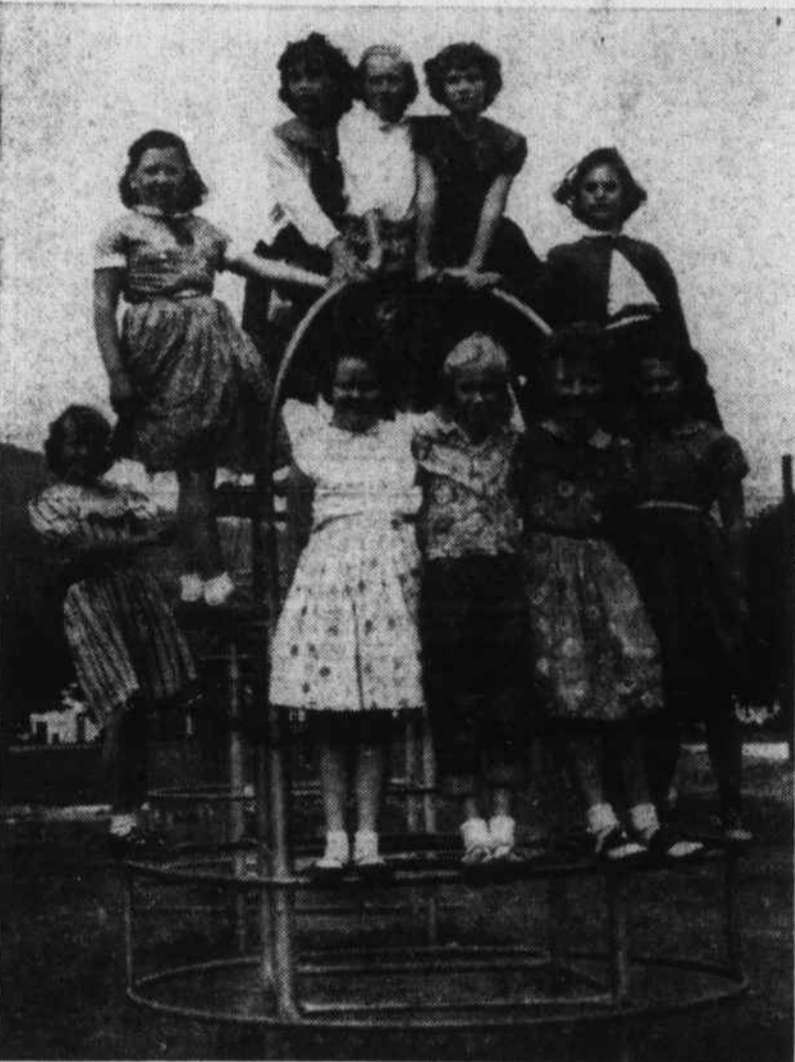
MANY HOURS of fun are being derived from this piece of playground equipment on the new Hazelwood playground, one of the Finer Carolina projects.