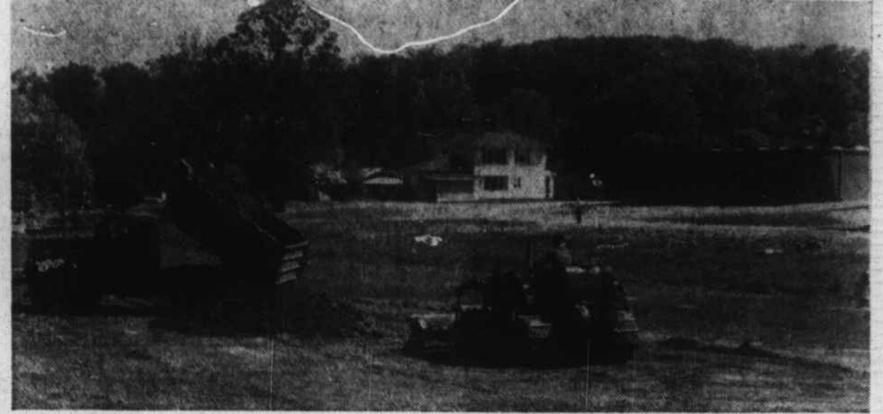
WORK STARTS on the playground. Much of the time was donated by interested citizens. This shows dirt being hauled into the area.