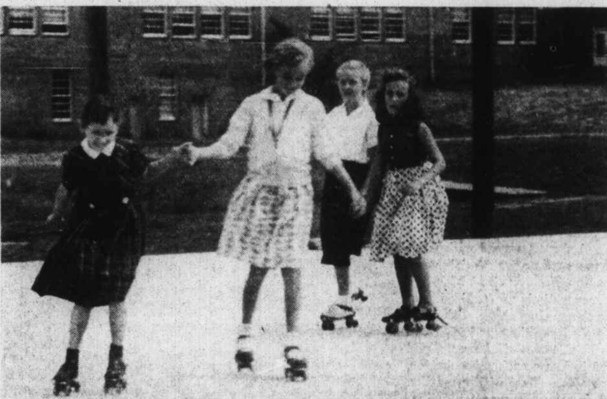
SKATING is a popular pastime for scores of Hazelwood children on the newly constructed playground, which is a "Finer Carolina" project, and just completed this year.