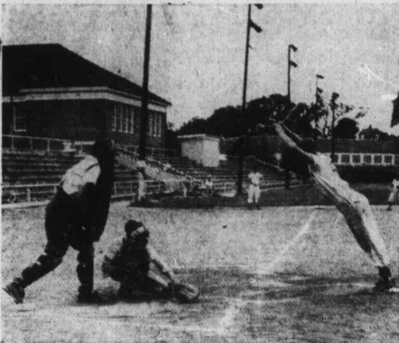
ONE, TWO, THREE AND YOU'RE OUT at the old ball game as the Hazelwood Junior Industrial team goes into action. The team is sponsored by the Hazelwood Lions Club. The Lions won the Western North Carolina pennant this year.

Already the fame of the playground has spread, and recently a delegation from an elementary school at Brevard visited Hazelwood to inspect the modern facilities.