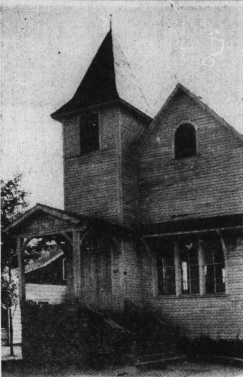
THE HAZELWOOD METHODIST CHURCH, established as a mission about 15 years ago, has outgrown its quarters. Members are setting aside funds for a new building.

A new Pastorium was recently purchased and renovated by the congregation of the Hazelwood Baptist Church.