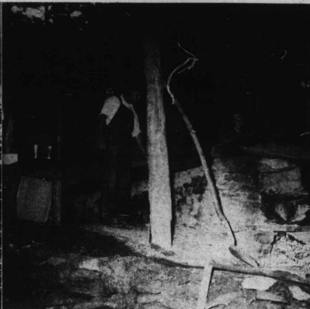
AFTER FLOWING into the barrel at right, the cane juice is cooked in the evaporator units for approximately one hour before being converted into molasses. An elongated stone fireplace provides the heat for the evaporator. While cooking, the molasses is kept in motion by operators with wooden paddles.