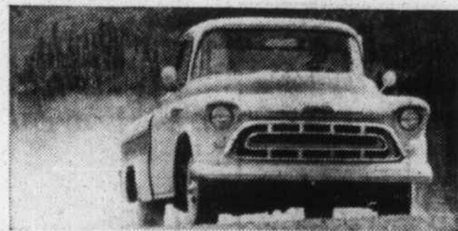
Alcan fleet reports up to 18.17 miles per gallon! That's the mileage reported by the Cameo Carrier, with Thriftmaster 6 and Overdrive (optional at extra cost).

Heavyweight Champs with Triple-Torque Tandem are rated at 32,000 lbs. GVW, 50,000 lbs. GCW. Special features include built-in 3-speed power divider.