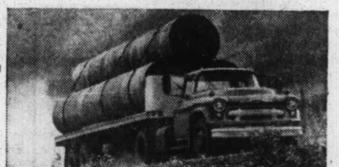
All the way in DRIVE range with Powermatic! This Powermatic-equipped 10000 Series tractor traveled the Alcan Highway in a single forward-speed range!