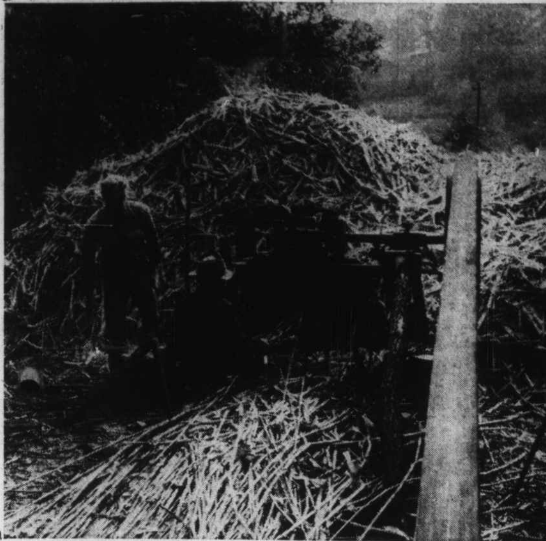
FIRST STEP in the making of molasses—mountain style—is to put syrup cane in a cane mill as is being done here on the W. J. McCrary farm on the Big Branch road in Crabtree community. After the juice is squeezed from the cane, it goes first into a vat and thence flows through a pipeline into a barrel on the evaporation unit.