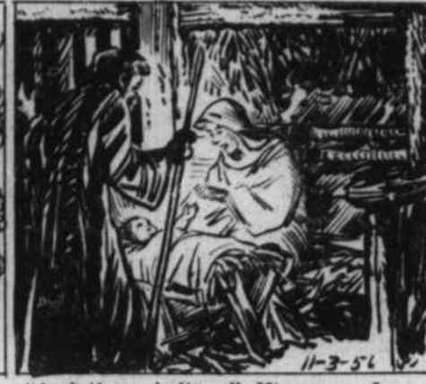
"And thou shalt call His name Jesus, for He shall save His people from their sins." MEMORY VERSE—Isaiah 53:5.