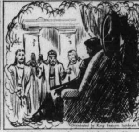
When Jesus was brought before Herod, the chief priests and Scribes accused Him violently, but Jesus was silent, as Isaiah foretold.