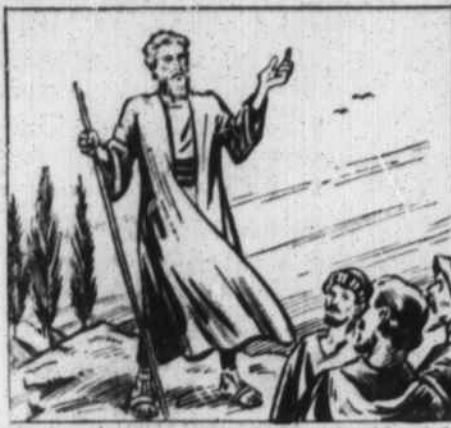
Isaiah prophesied that when the Messiah came He would be "despised and rejected of men; a man of sorrow, and acquainted with grief."

Scripture—Isaiah 52:13—53:12; Matthew 1:18-21.