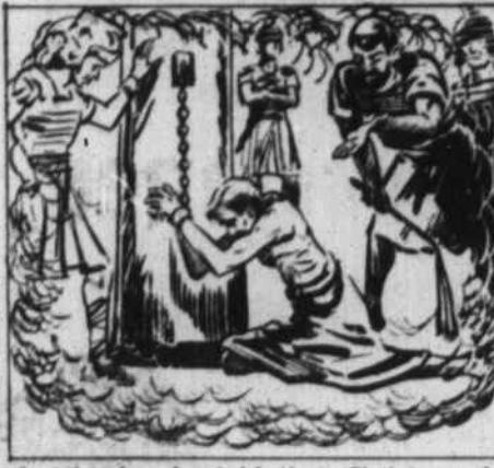
Isaiah also foretold that Christ would be beaten and wounded, but by His sufferings we, the sinful ones, would be healed.