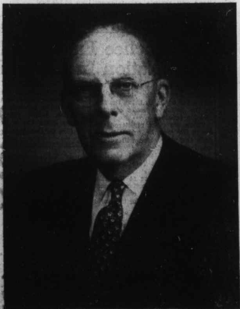
REP. GEORGE A. SHUFORD Democratic nominee for re-election