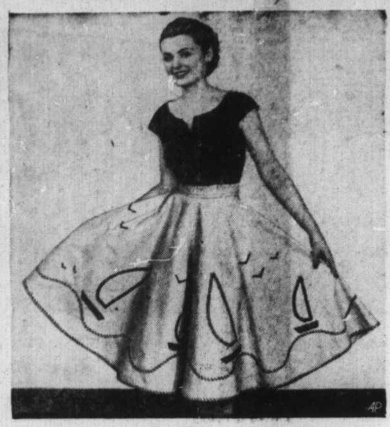
NEW LIFE FOR AN OLD SKIRT . . . Colorful sailboat and sea gull appliques are stitched in contrasting bias binding. Wide rickrack braid in two colors is used to simulate ocean waves as colorful edging for the hemline of the skirt,