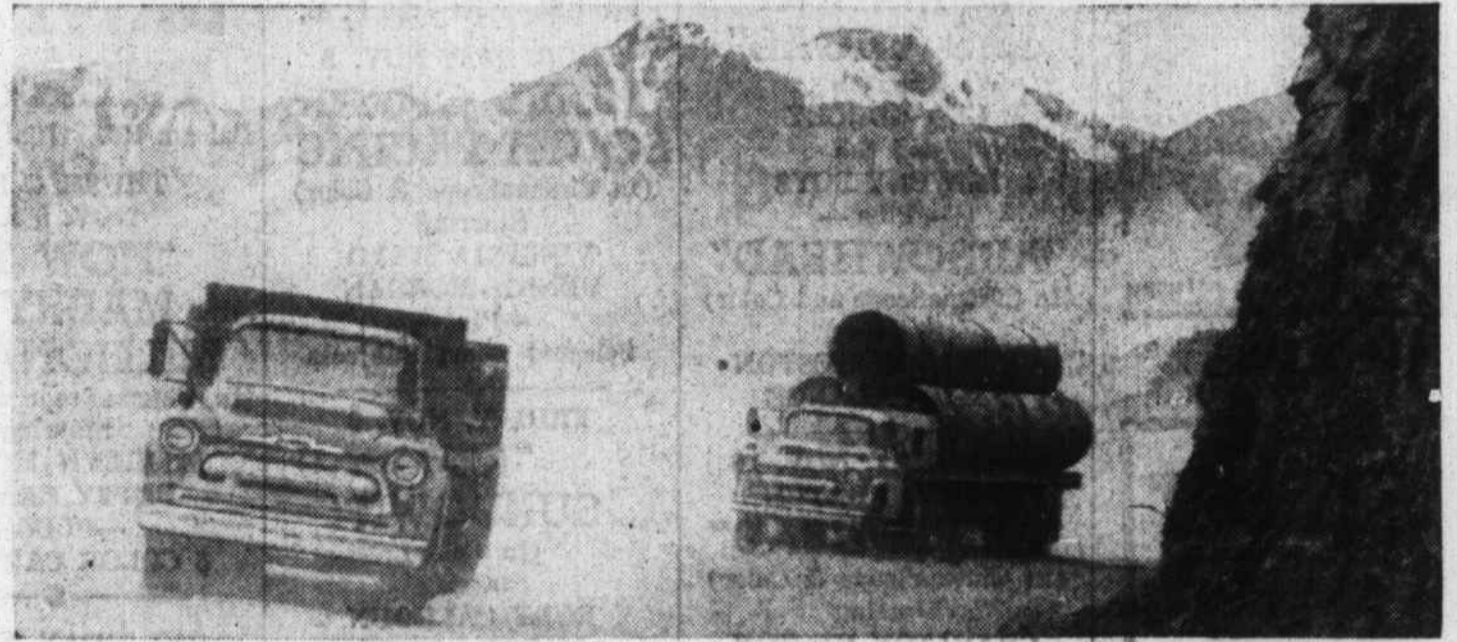
Rated G.V.W. of these payload-carrying heavyweights goes all the way up to 32,000 pounds!

They "flattened" Yukon mountains with the most modern truck V8's of all!