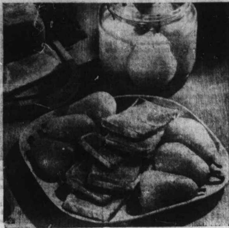
GOOD GARNISH FOR HAM . . . pickled pears.