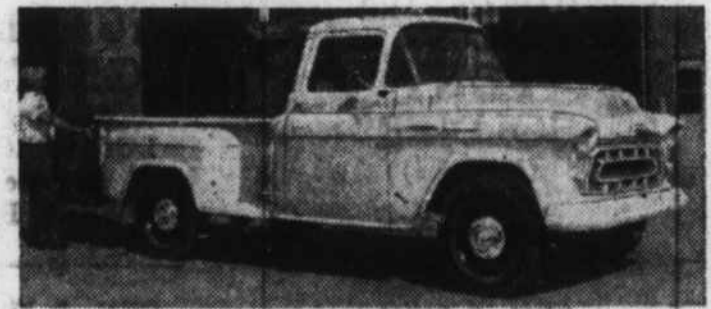
Whatever your job, there's an Alcan-proved Chevrolet Task-Force truck ready right now to save you time and money!

New V8-powered '57 Chevrolet trucks, heavily loaded, made one of the world's toughest roads look easy! In a straight-through test run, they rolled over the famous ALCAN Highway to Alaska—in less than 45 hours (normally a 72-hour run). Here's proof-in-action of power that'll handle your toughest jobs—and keep coming back for more!