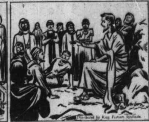
and taught them."