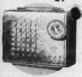
BULOVA PORTABLE RADIO $2995