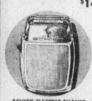
SCHICK ELECTRIC SHAVER $2950